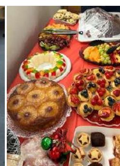
Buffet

We thank all the Catechists for their continuous effort and dedication in taking the Gospel to our children and young people.